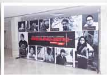
Vice Chancellor at World Congress on Education