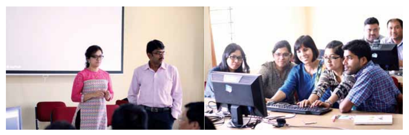
The workshop aimed at empowering northeastern work force with IoT Skills to support Digital India and Smart City initiatives by Government of India.

The University's Department of Computer Science & Engineering and Information Technology in collaboration with CDAC – Pune and Silchar organized a two-day workshop titled 'Internet of Things (IoT)' at the University's Azara Campus, 26-27 May 2016.