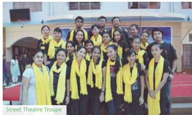
Street Theatre Troupe

The students of Masters in Psychology (Psychological Counselling) observed 'World Suicide Prevention Day' in the University through a special morning assembly for the entire university and later by an engrossing street play. The play titled "Who Comits Suicide?" was performed for the students of the School of Technology and the School of Humanities and Social Sciences.