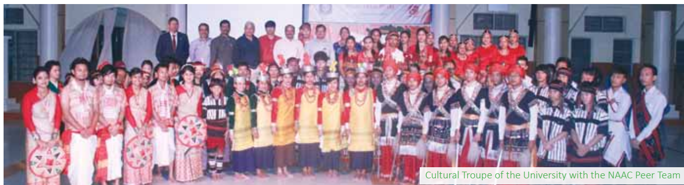
Cultural Troupe of the University with the NAAC Peer Team