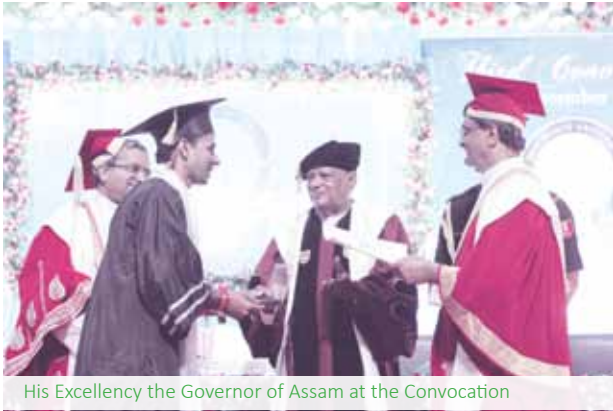
His Excellency the Governor of Assam at the Convocation