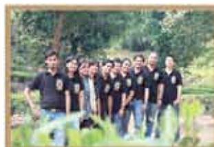
Appreciation Day 2014 ...the joy of togetherness!