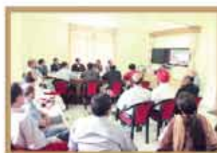
The Core Committee of the University Interacts with NAAC Peer Team