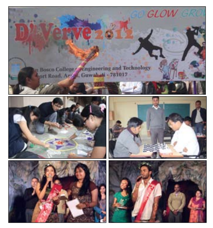
um with a specially prepared stage backdrop that portrayed the five elements – air, water, earth, fire and sky.

The concluding day had as its prime attraction a fashion show on the theme "Five Elements" held in the college atri-