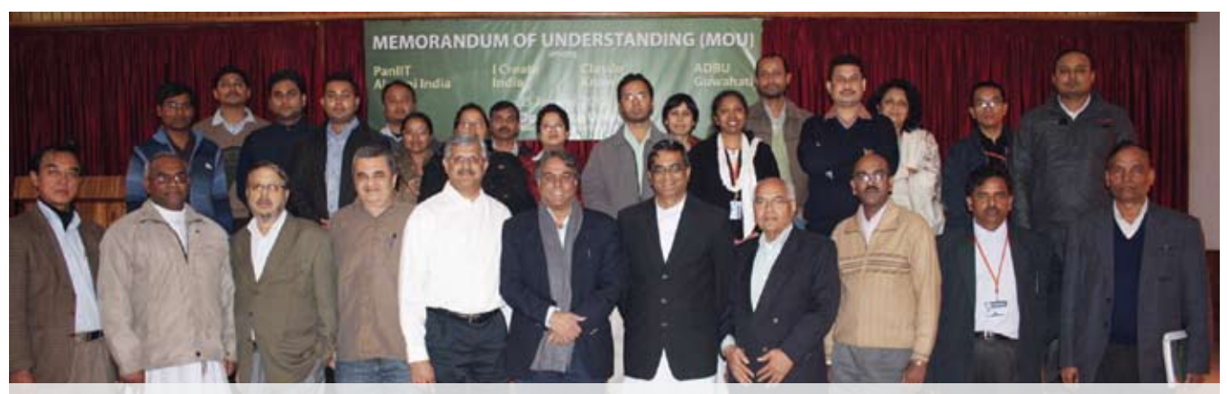
Assam Don Bosco University Signs MOUs with 'Classle Knowledge', 'I Create India' and 'PanIIT India'

Assam Don Bosco University signed MOUs with 'Classle Knowledge', 'I Create India' and 'PanIIT India' on 25 January 2012 in a formal gathering held at Azara campus.